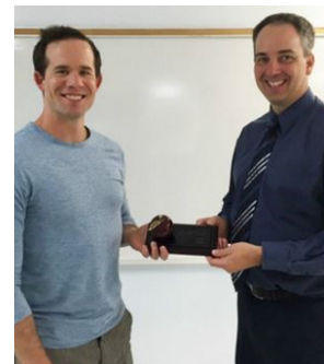
James Fuller Caroline School